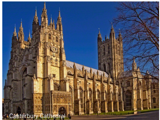
Excursions are subject to change.