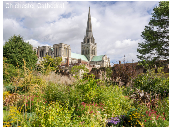
Excursions are subject to change.