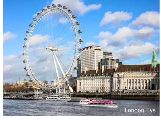
Excursions are subject to change.