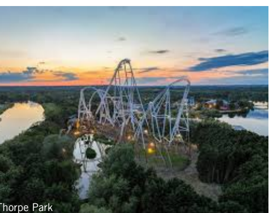
Excursions are subject to change.